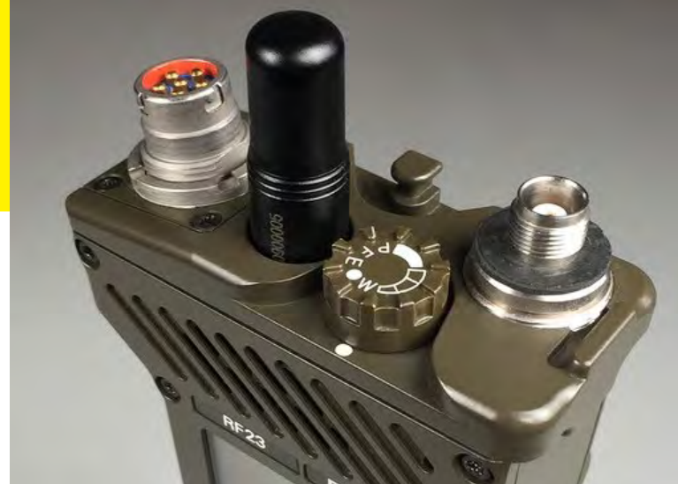
including LP1302 battery pack, without GPS antenna