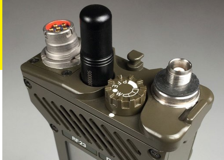
including LP1302 battery pack, without GPS antenna